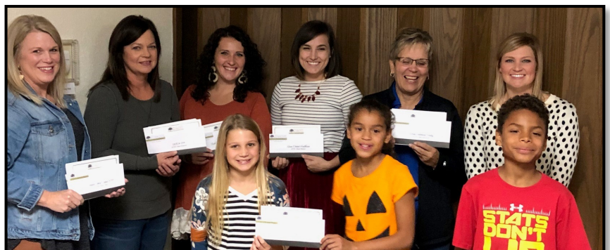
BARBER COUNTY COMMUNITY GRANT RECIPIENTS