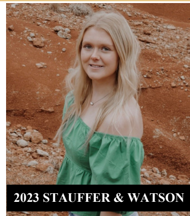
2023 STAUFFER & WATSON