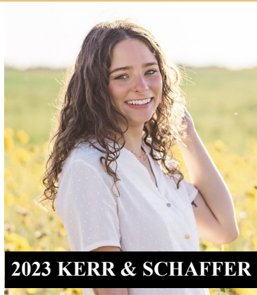
2023 KERR & SCHAFFER