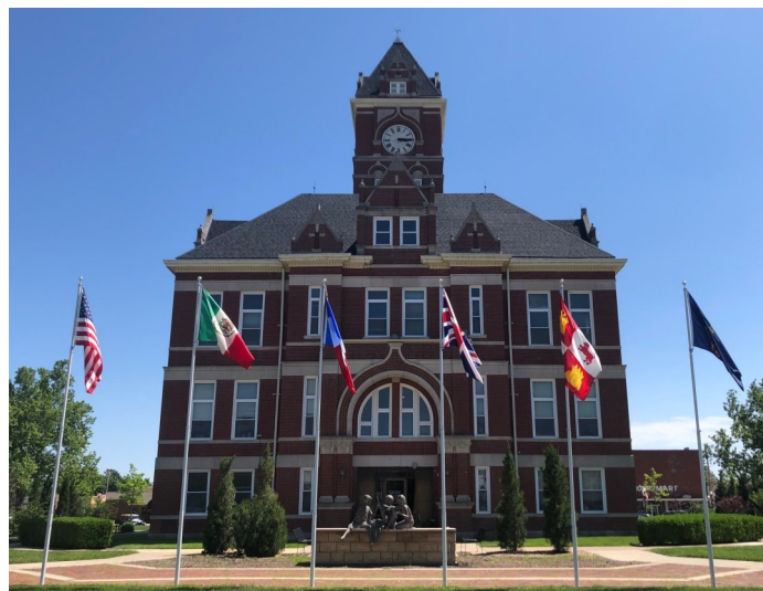
RICE COUNTY COURTHOUSE

If you cannot attend the tours in person, we have created an online survey to help voice your opinion. Find the link on our Facebook page or the Foundation's website at sccfks.org .