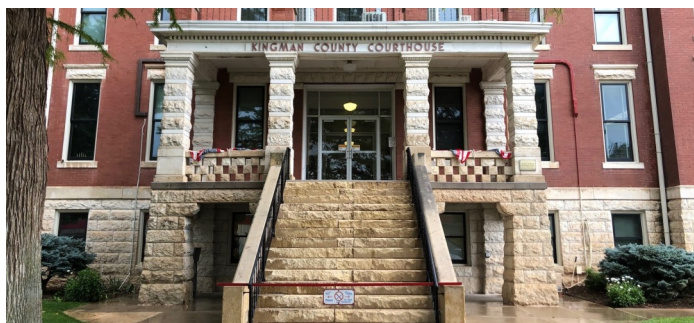
KINGMAN COUNTY COURTHOUSE

To date, we have completed seven of the nine tours and look forward to compiling all the data to share with our supporters.